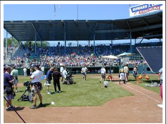
Crewmembers from "Mickey" outnumbered the players during the filming of "Mickey" at Howard J. Lamade Stadium in June 2001.