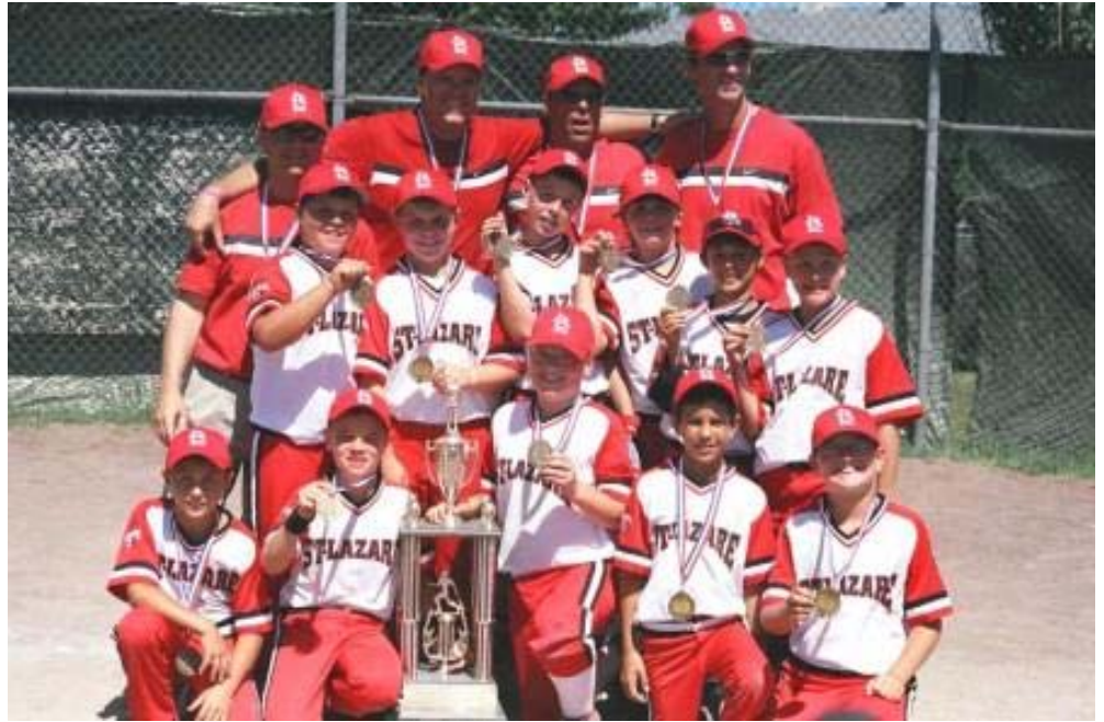
St-Lazare Minor District 2 Champions Quebec Provincial Champions

You keep submitting them, and I'll keep putting them in...there are still a huge number of winning teams that were not recognized in the last issue.