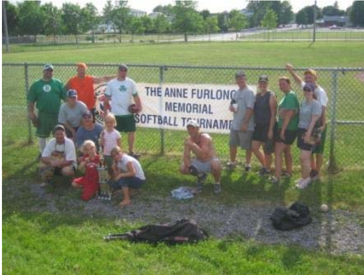
The Marvels...winners of the Anne Furlong Memorial Tournament